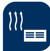
Air heating systems