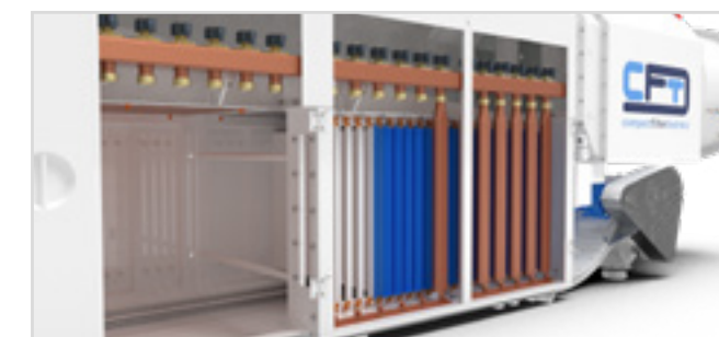
CFD with discharge scraper chain conveyor