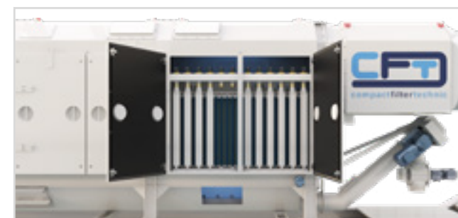
CFD with dust collection trough with screw conveyor