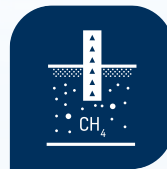
Methane Drainage and Utilization