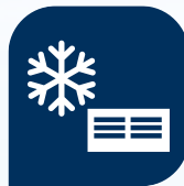
Air cooling systems